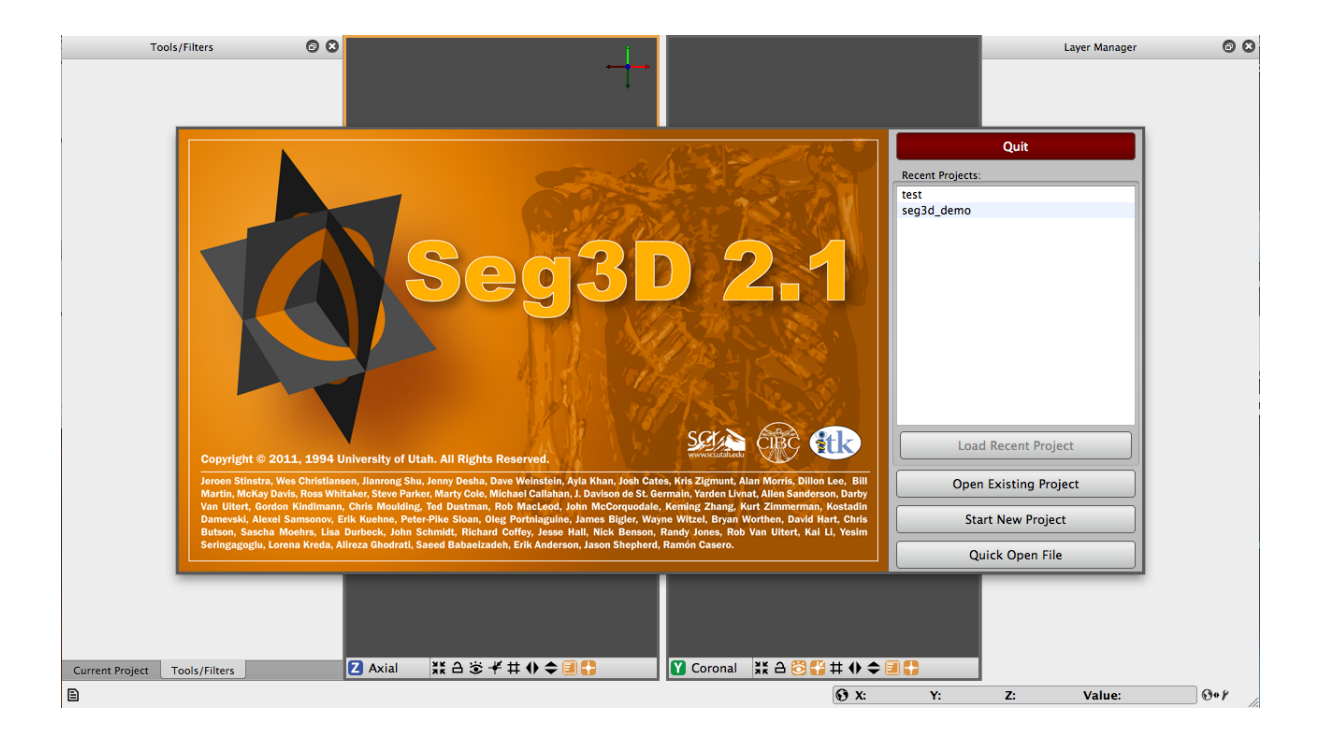
Figure 3.1. Welcome screen for Seg3D

at a single segmentation or image file, or you may quite Seg3D if you have changed your mind.