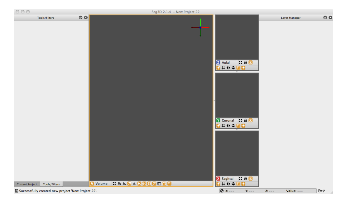
Figure 3.2. Blank workspace of Seg3D

Now the angiogram of the pig that you saw in the demo will appear (Figure 3.3) and we suggest that you take this time to familiarize yourself with the controls of the software. Make sure you figure out how to navigate through the slices and adjust the view on the 3D viewer. Try to figure out some of the simple tools first, such as the threshold tool, or paint brush. If you decide you would like some more guidance, look at some of the other datasets provided, or try one of the tutorials. Once you learn your way around Seg3D, the skill of segmenting will rely on your knowledge of the data you are segmenting and your familiarity with each of the tools available.